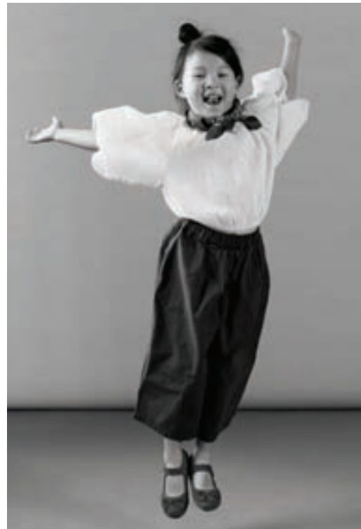
Shirt · Tambere, Ziraffe Trousers · Mummymoon, Ziraffe Scarf · Misha & Puff Shoes · Livie & Luca

“Lucky fins are awesome. It’s adorable &